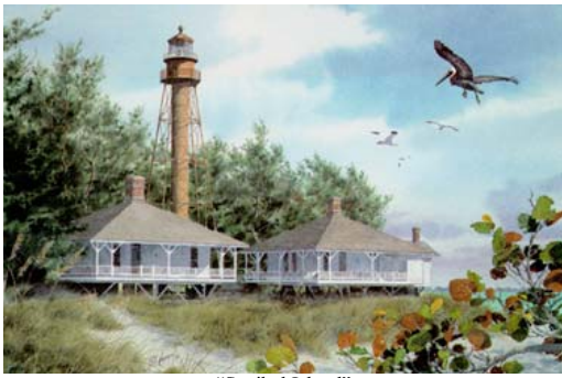
"Sanibel Island" Size: 20" x 29" Edition: 950 S/N Price: $140