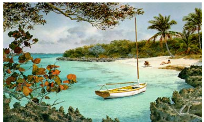
"Hidden Cove" Size: 20" x 29" Edition: 950 S/N Prints Price: $140