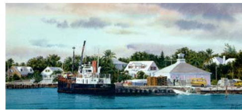
“Government Dock” Size: 13” x 27” Edition: 1750 S/N Price: $95