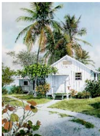
“Pigeon Key” Size: 16” x 21” Edition: 950 S/N Price: $95