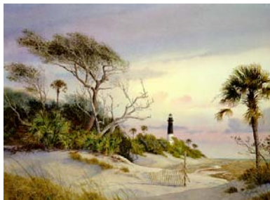
“First Light” Size: 16” x 21” Edition: 950 S/N Price: $95