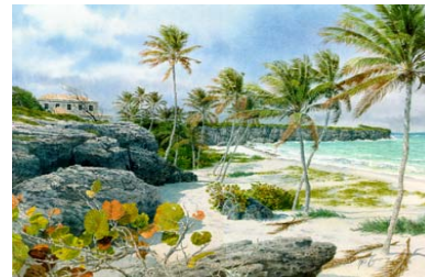
“Harrismith Beach” Size: 16” x 21” Edition: 950 S/N Price: $95