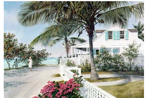
"Harbour Island" Size: 20" x 29" Edition: 950 S/N Price: $140 Limited Availability