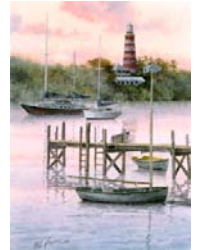
“Hope Town Sunset” Size: 6 1/2” x 8 1/2” Edition: 950 S/N Price: $15