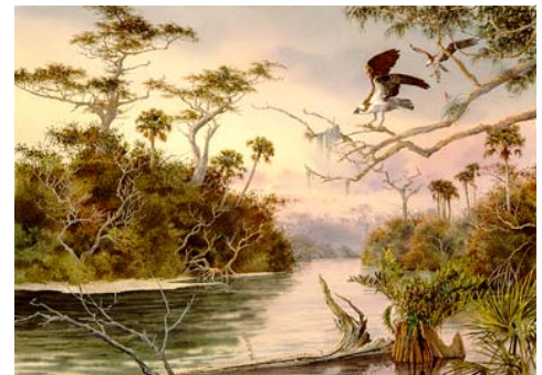
“Loxahatchee River” Size: 21” x 29” Edition: 1500 S/N Price: $140