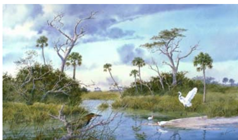
“Suwannee Estuary” Size: 17” x 29” Edition: 950 S/N Price: $115