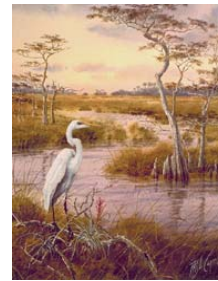
“American Egret” Size: 12” x 16” Edition: 1500 S/N Price: $50