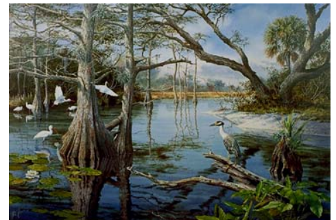
“Cypress Creek” Size: 20” x 29” Edition: 850 S/N Price: $140