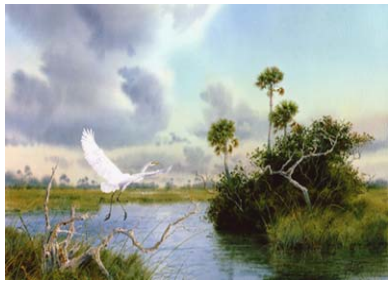
“Summer Morning” Size: 16 1/2” x 23” Edition: 950 S/N Price: $100