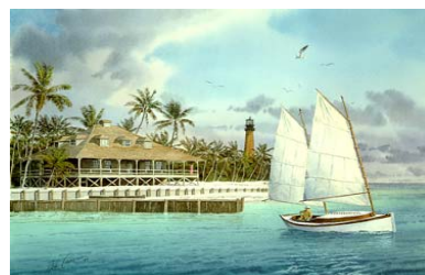
“Egret at Cape Florida” Size: 16” x 21” Edition: 200 Signed Poster Price: $25