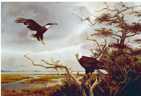
“American Bald Eagle” Size: 20” x 29” Edition: 950 S/N Price: $140