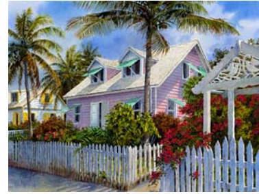
“Island Cottage” Size: 16” x 21” Edition: 950 S/N Price: $95