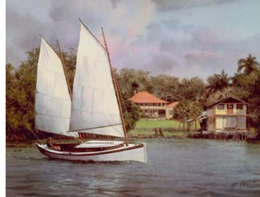
“Egret at the Barnacle” Size: 16” x 21” Edition: Signed Open Price: $50 Limited Availability