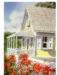
“Poinsettias” Size: 6” x 8” Edition: 950 S/N Price: $15