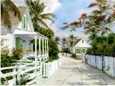
“Hopetown” Size: 16” x 21” Edition: 1500 S/N Price: $95