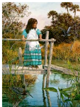
“Florida Natives” Size: 21” x 29” Edition: 950 S/N Price: $95