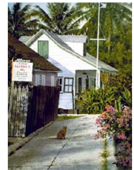
"Albury's" Size: 12" x 16" Edition: 1500 S/N Price: $50