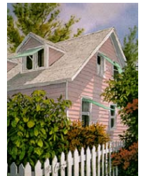
“Pink Cottage II” Size: 6” x 8” Edition: 950 S/N Price: $15