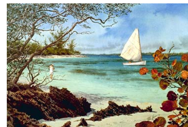
“Beachcomber” Size: 16” x 22” Edition: 250 S/N Price: $125 Limited Availability