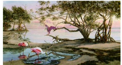
“Roseate Spoonbills, Matheson Hammock” Size: 16” x 29” Edition: 1500 S/N Price: $110