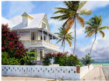
“Key West House” Size: 16” x 21” Edition: 950 S/N Price: $95