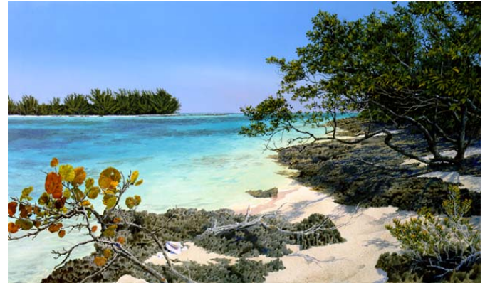
"Out Island Paradise" Offset Lithograph Size: 22" x 38" $175 Edition: 950 S/N Price: $175