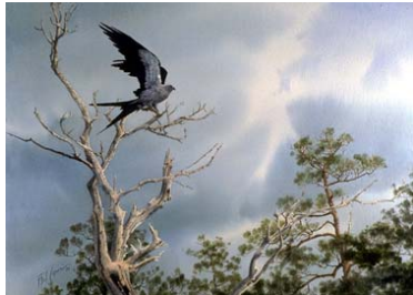
“Pinelands Hunter” Size: 16” x 21” Open Edition Price: $50