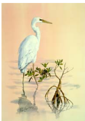
“Great White Heron” 7 1/2” x 11” limited edition $25