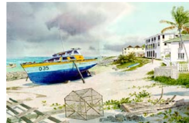
“Atlantis Hotel” Size: 16” x 21” Edition: 950 S/N Price: $95