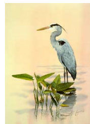
“Great Blue Heron II” 7 1/2” x 11” Limited edition $25