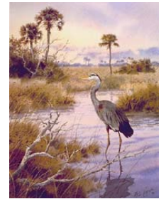
“Great Blue Heron” Size: 12” x 16” Edition: 1500 S/N Price: $50