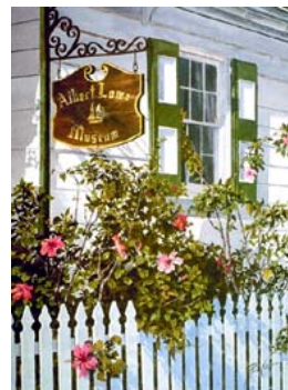
"Albert Lowe Museum" Size: 12" x 16" Edition: 1500 S/N Price: $50