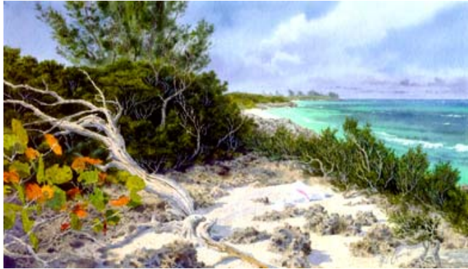
"Windward Shore" Size: 20" x 38" Edition: 950 S/N Price: $175