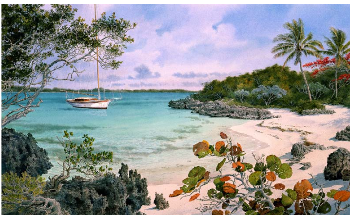
"Safe at Anchor" Size: 22" x 36" Edition: 950 S/N Prints Price: $175