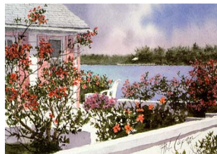
“Settlement Creek” Size: 6” x 8” Edition: 950 S/N Price: $15