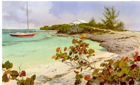
“Man-O-War” Size: 17” x 29” Open Edition Price: $60