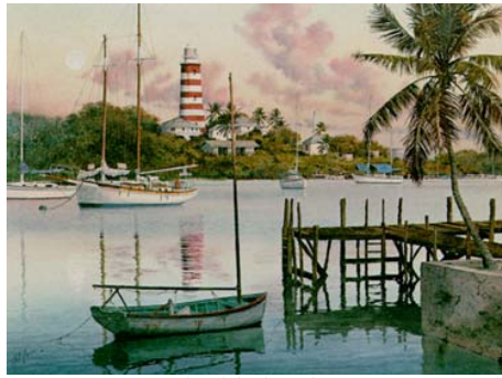
"Daybreak in the Bahamas" Size: 20" x 29" Edition: 950 S/N Price: $140