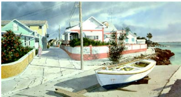
"Waterfront" Size: 10" x 17" Edition: 950 S/N Price: $60