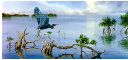
“Little Blue Heron” Size: 10” x 22 1/2” Edition: 950 S/N Price: $75