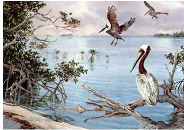
“Brown Pelicans” Size: 16” x 21” Edition: 950 S/N Price: $95